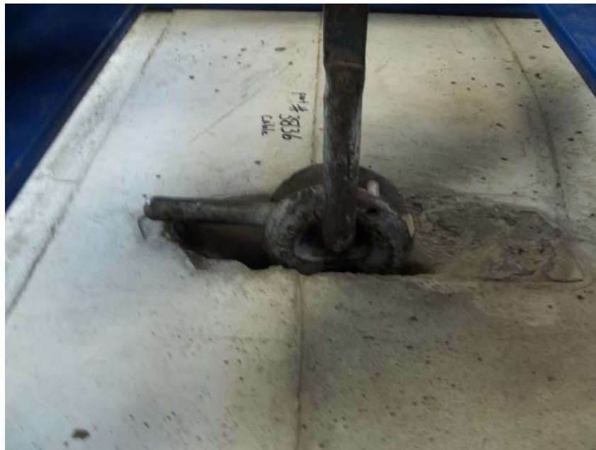
Figure 1 – 90-degree Tension Test Set-up