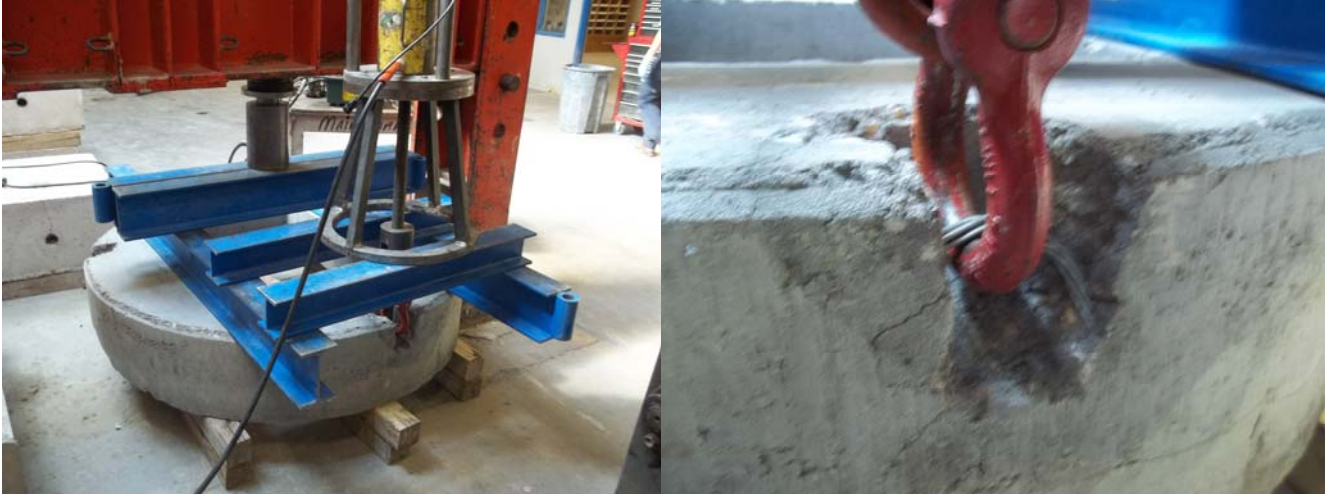
Figure 1 – 90-degree Tension Test Set-up