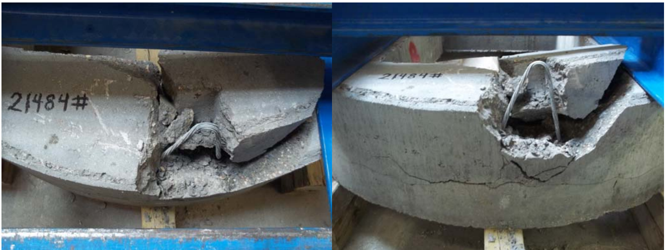
Figure 2 – Tension Failure Mode