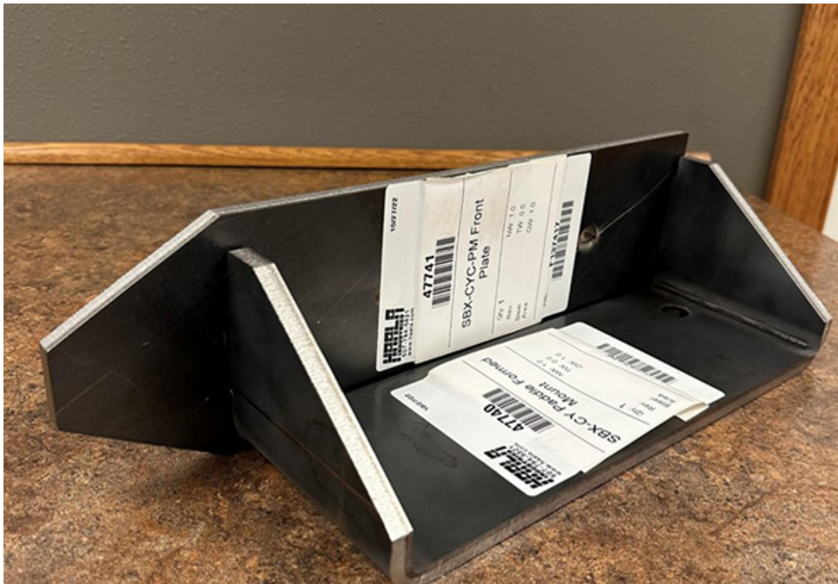
Custom Metal Fabrication