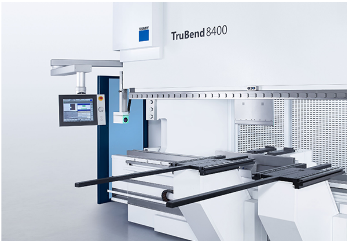
Trumpf Press Brake*